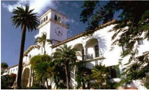
The County Courthouse is one of the architectural gems of Downtown Santa Barbara.